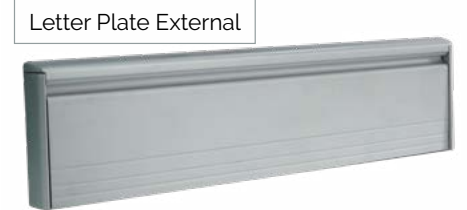
Letter Plate External