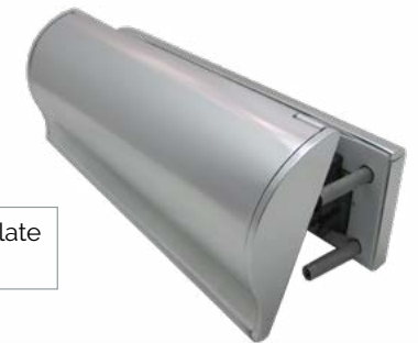
Letter Plate Internal